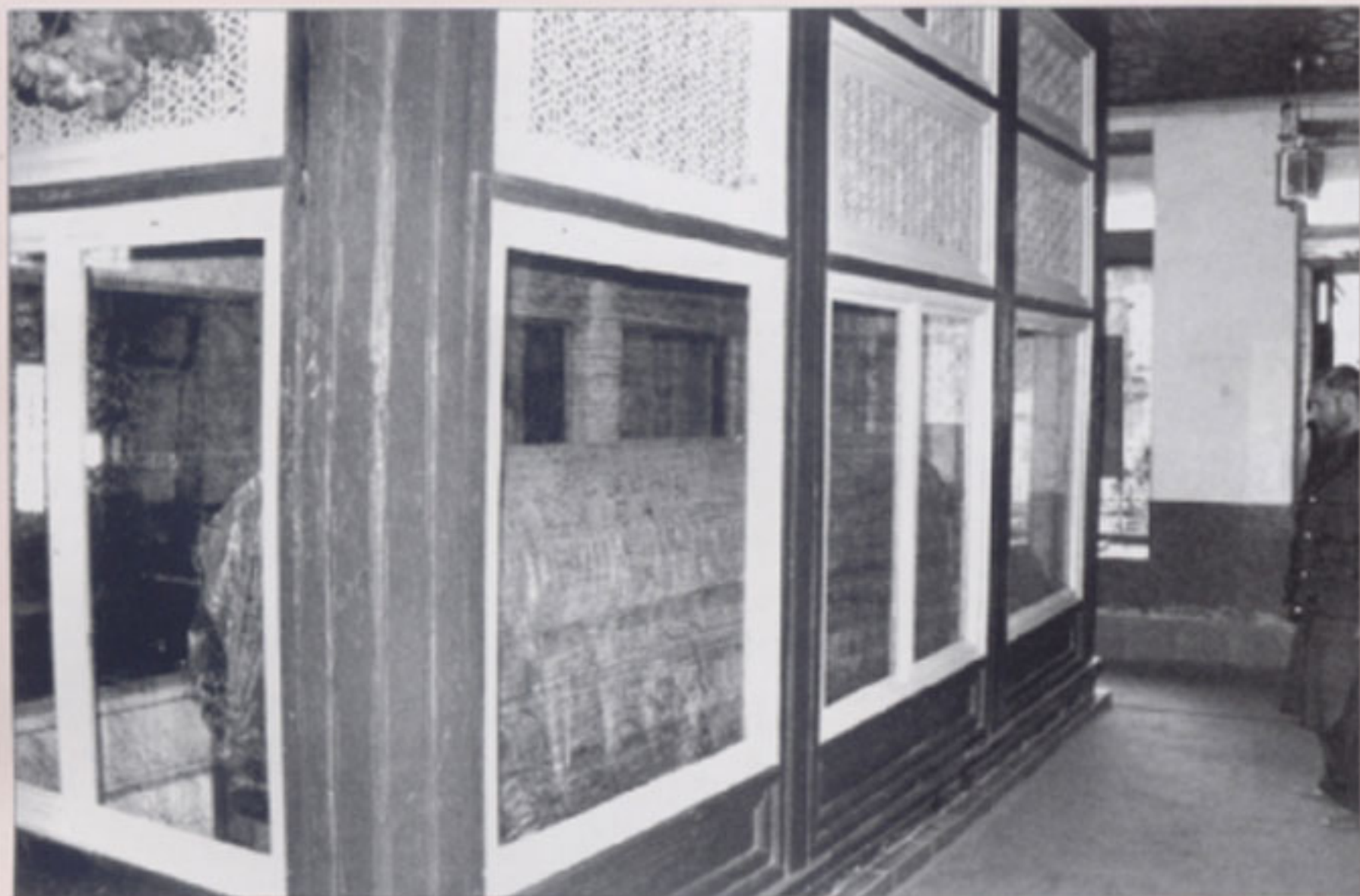
THE TOMB OF JESUS Khanyar Street, Srinagar, Kashmir